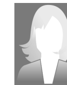
Gwendolyn Byfield 17th