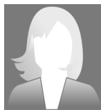
Fay Hibbert 10th