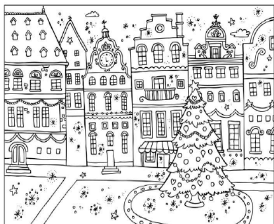
Find the differences!

Applications for teachers' colleges will open between January/February 2012. These colleges include Bethlehem Moravian, Church, Sam Sharpe, Shortwood and St. Josephs