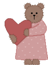
Be My Valentine